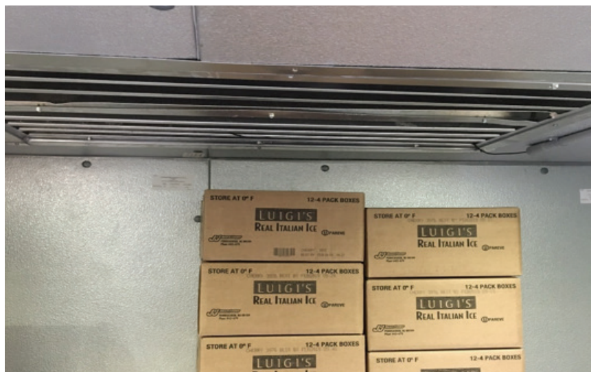
Figure 6 - Ceiling After KE2 Adaptive Control Installed

The icicles that formed while the digital controller was managing the system (as shown in Figure 1) are eliminated, see Figure 6 above. Other surfaces such as the walls, floors, and product, were also free of ice after the KE2 Adaptive Control was installed.