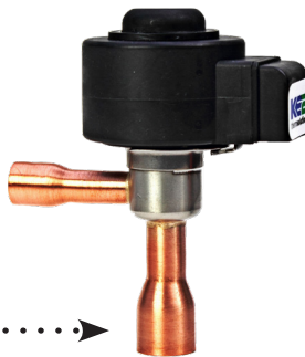
KE2 RSV Electronic Expansion Valve (EEV)