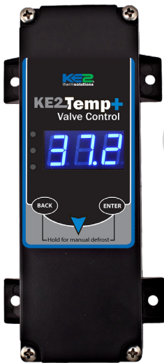
KE2 Temp + Valve Air Defrost Controller