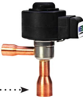
KE2 RSV Electronic Expansion Valve (EEV)

Flexible RSVs control over a wide operating range & refrigerants