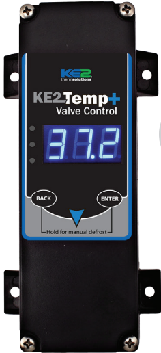
KE2 Temp + Valve Air Defrost Controller